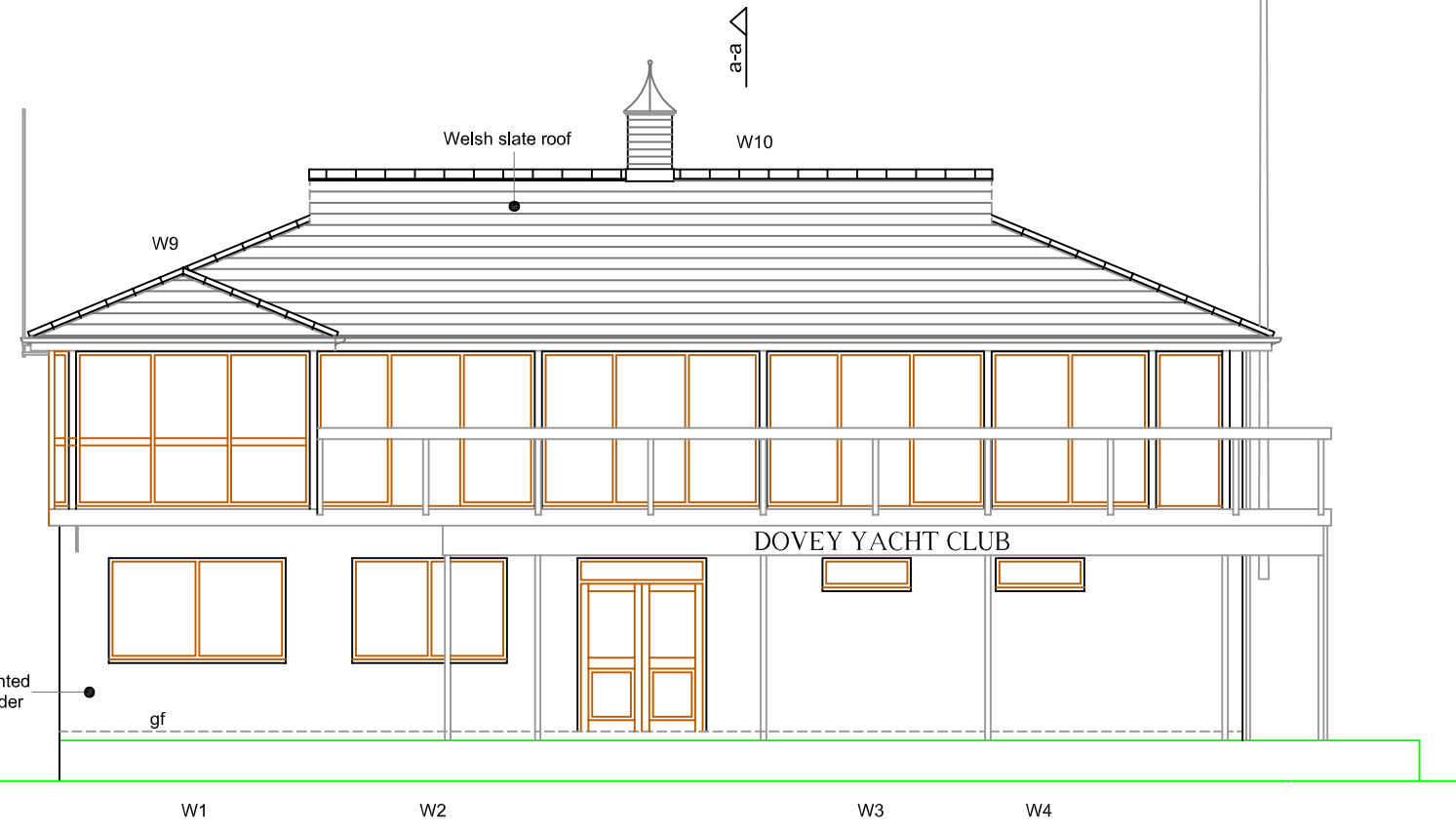
south elevation No change